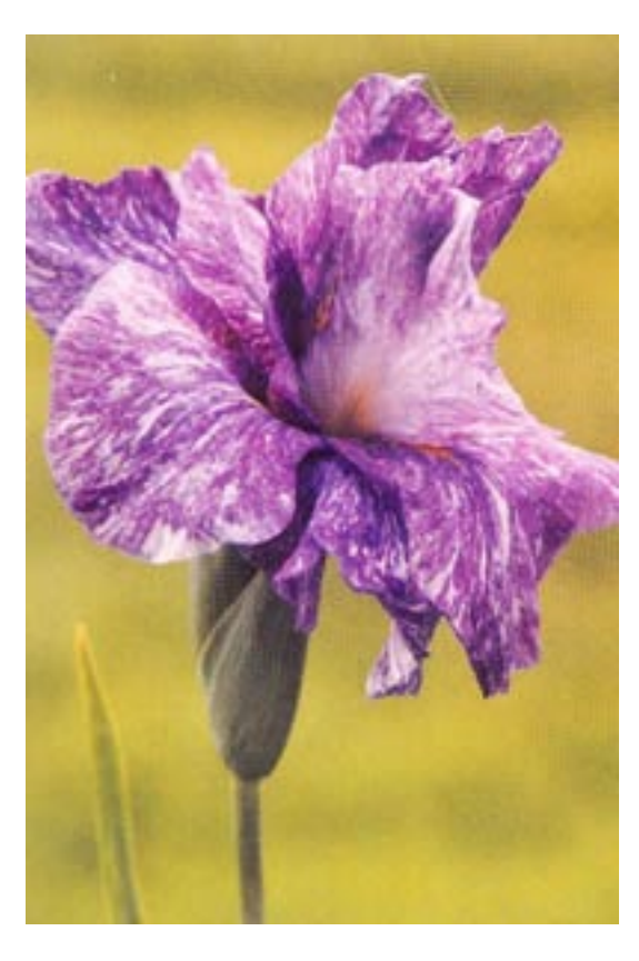
Mottled Beauty Iris