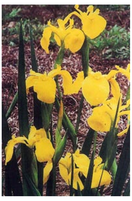
Yellow Flag Iris